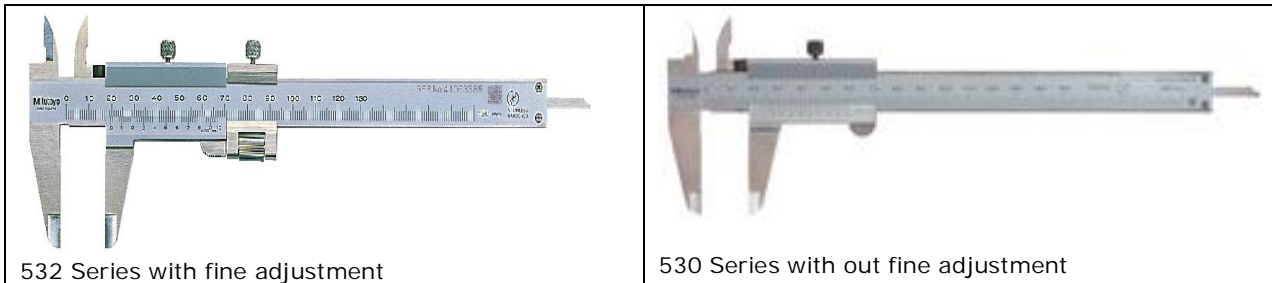
532 Series with fine adjustment