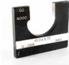
FIXED SNAP GAUGE