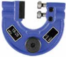
ADJUSTABLE SNAP GAUGE

For checking outer/groove diameters, flange widths, Go/No Go Gauging